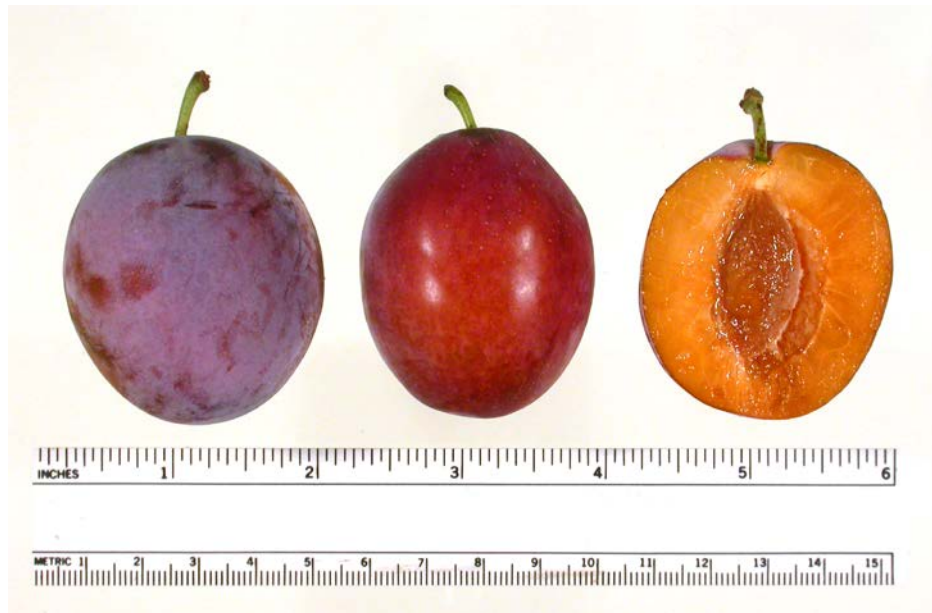
Muir Beauty fruit (D6N-72)

Muir Beauty is new dried plum cultivar developed within the University of California Dried Plum/Prune Cultivar Improvement Program for use by the dried fruit industry. Muir Beauty is an excellent dried plum that ripens earlier than both the UCD cultivar of Sutter and the commonly grown variety of Improved French. This earlier maturity will allow growers the opportunity to spread the time of harvest and maximize their drying efficiency. Muir Beauty is also the recommended pollinizer for the UCD plum cultivar Tulare Giant.